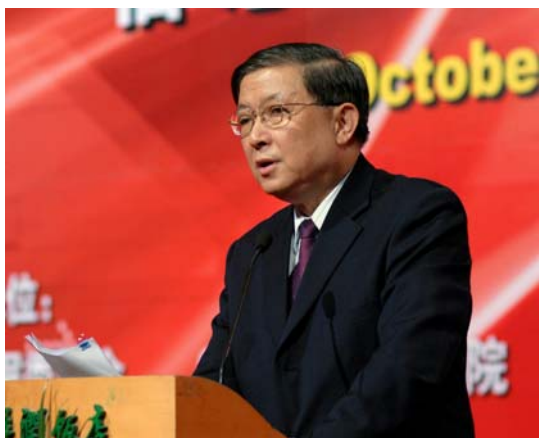
Professor Xu Guanhua

The 20 th International CODATA conference, “ Scientific Data and Knowledge within the Information Society ,” took place in Beijing on 22-25 October 2006. It was without a doubt the most successful and largest conference in CODATA’s 40 year history. It attracted more than 600 participants from approximately 30 countries.