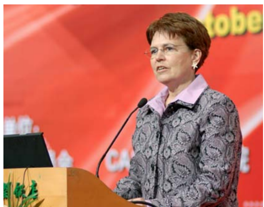
Professor Jane Lubchenco