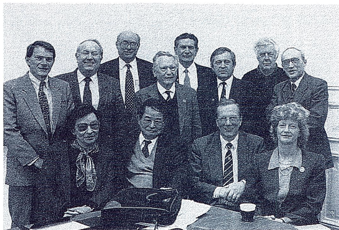
CODATA Executive Committee pauses for a portrait in the Conference Room.

23-24 CODATA General Assembly. Beijing, China